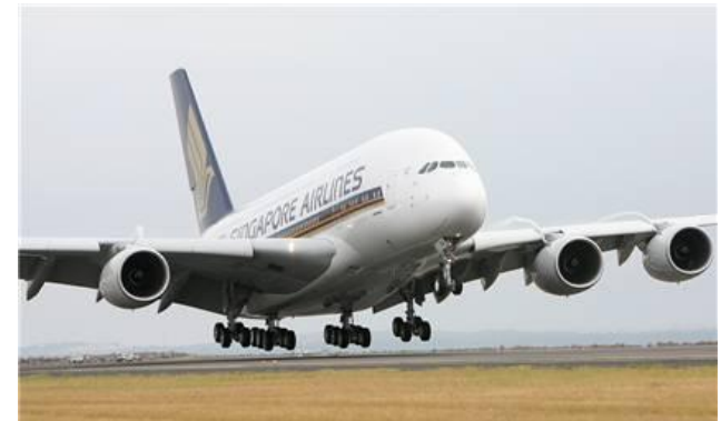
Next level Results